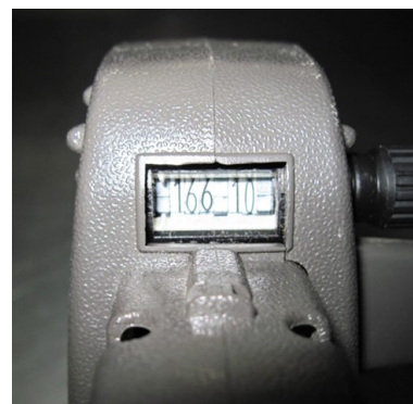
A label gun for produce coding.

Note that there is a separate Julian calendar for leap year.